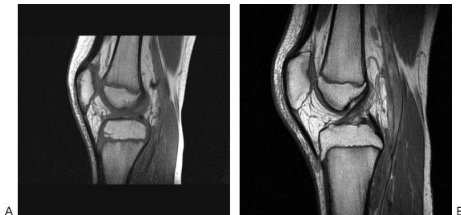
Fig. 1 (A, B) Respectively proton density and T2-weighted magnetic resonance imaging of the right knee at the age of 8 years, showed normal menisci, but a midsubstance anterior cruciate ligament rupture.

Few authors have described ACL regeneration with conservative treatment. Fujimoto et al concluded that patients with low athletic demands and sedentary occupation, with an intraligamentary ACL lesion but with continuity on MRI, could be treated successfully with an extension block soft brace. 6 Malanga et al showed that tear location might